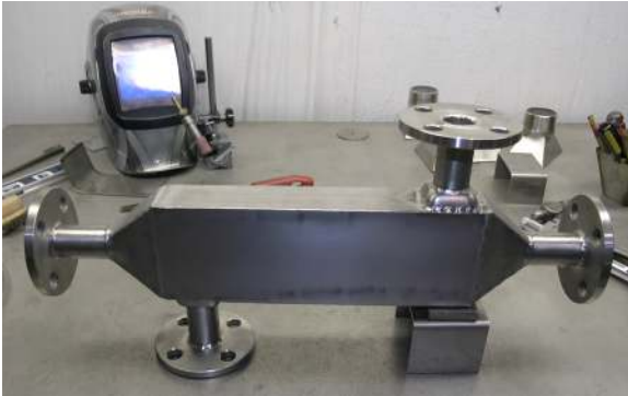
Custom Titanium 5.0 ST with 1 inch flanges

Salt water pools provide a silky smooth experience and may have less chemical maintenance, but there are issues in using a salt particle rich electrolytic solution with a stainless steel heat exchanger.